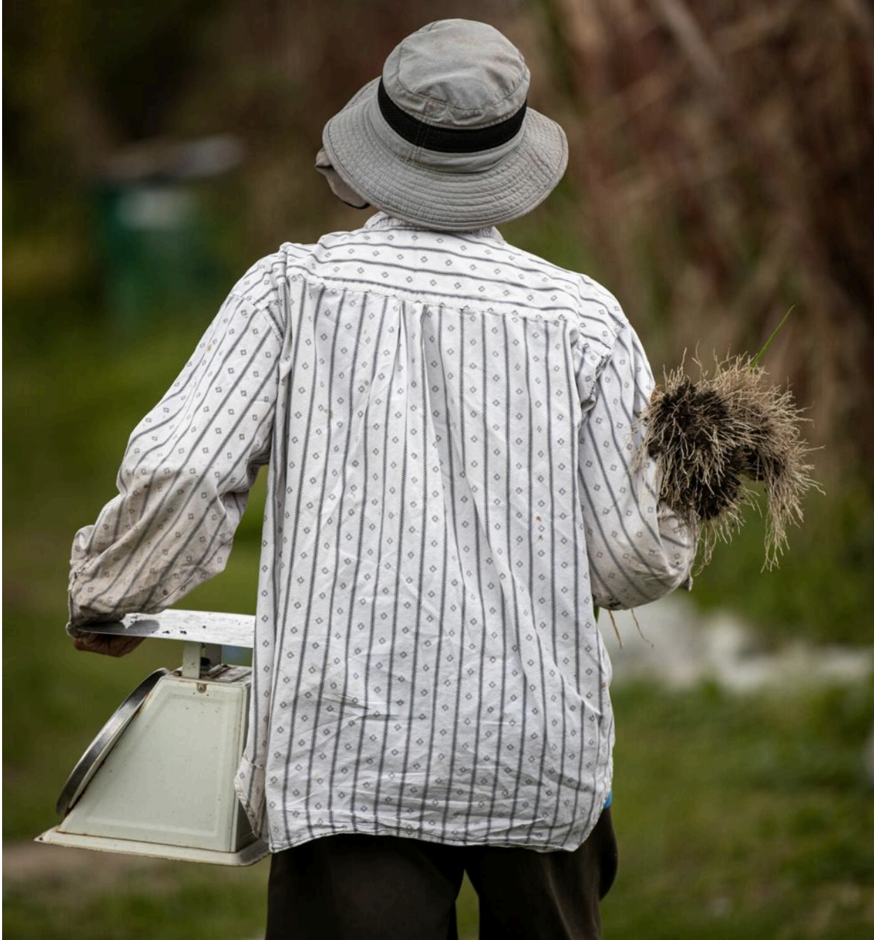
The Village de L'Est Green Growers Initiative, commonly called the VEGGI Farmers Cooperative, has been a lifeline for many Vietnamese-Americans in New Orleans East, and not just because it offers a healthy post-retirement diversion. Photographed Monday, March 27, 2023.