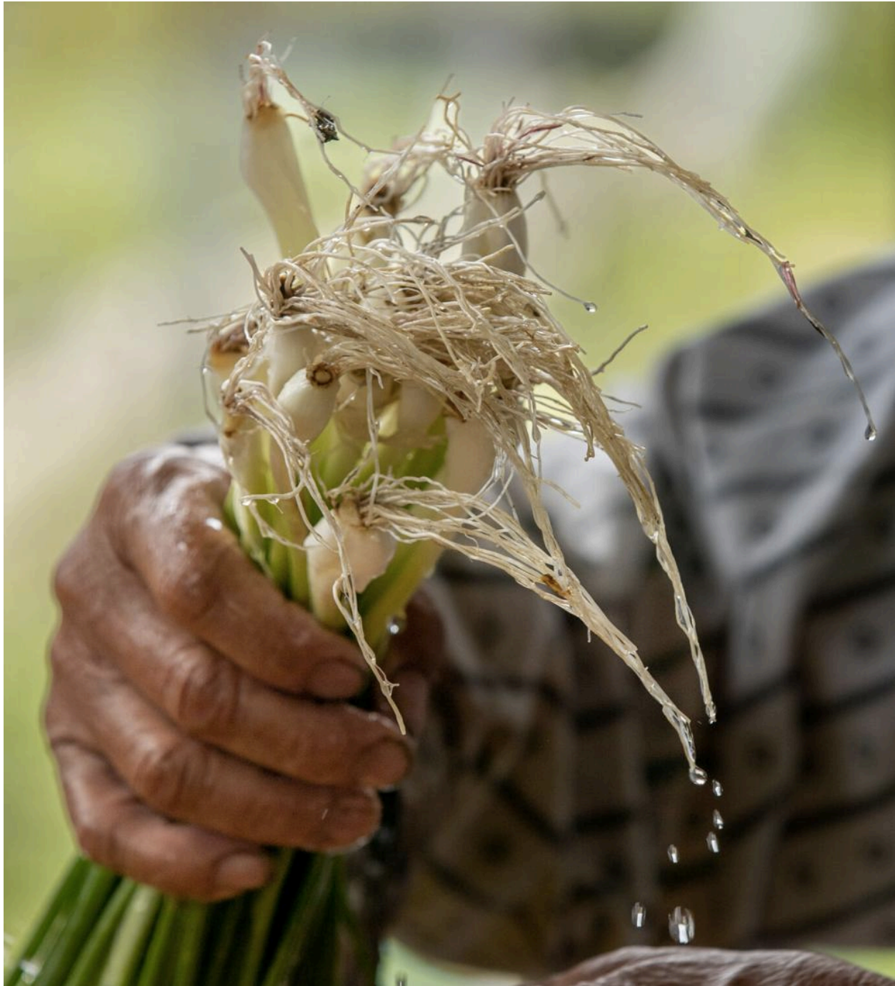
The Village de L'Est Green Growers Initiative, commonly called the VEGGI Farmers Cooperative, has been a lifeline for many Vietnamese-Americans in New Orleans East, and not just because it offers a healthy post-retirement diversion. Photographed Monday, March 27, 2023.